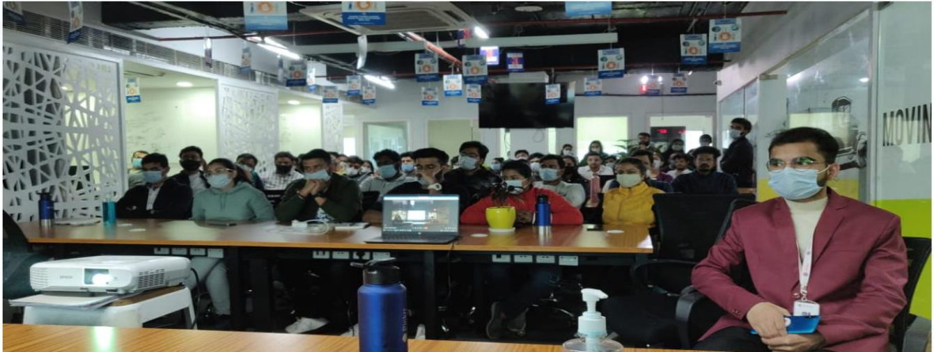
On campus training at a Gurugram corporate office